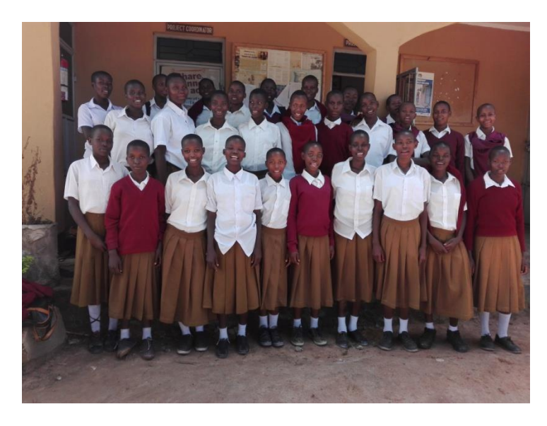
Secondary school girls schooling at Mugumu Secondary school