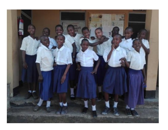
Primary school girls in their uniforms